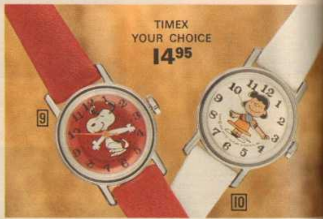
TIMEX YOUR CHOICE 14 95