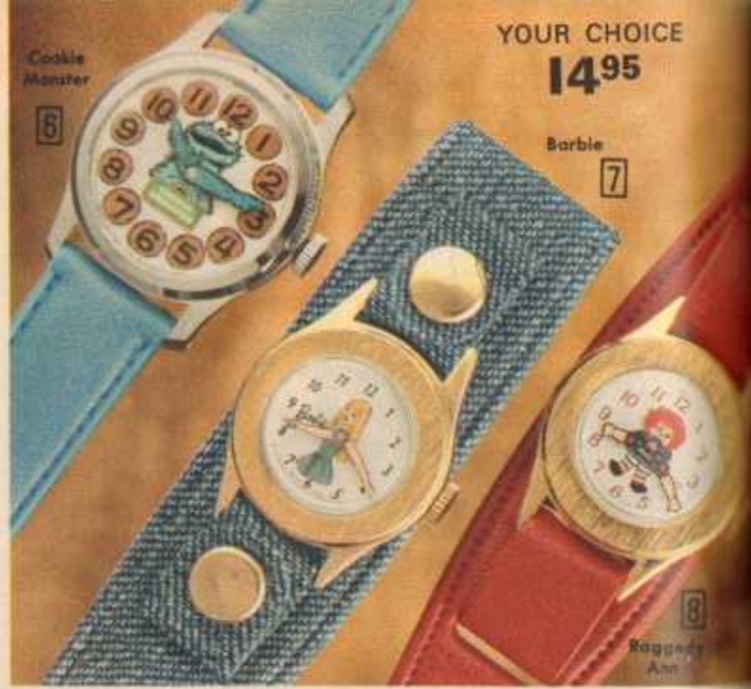
YOUR CHOICE 14 95