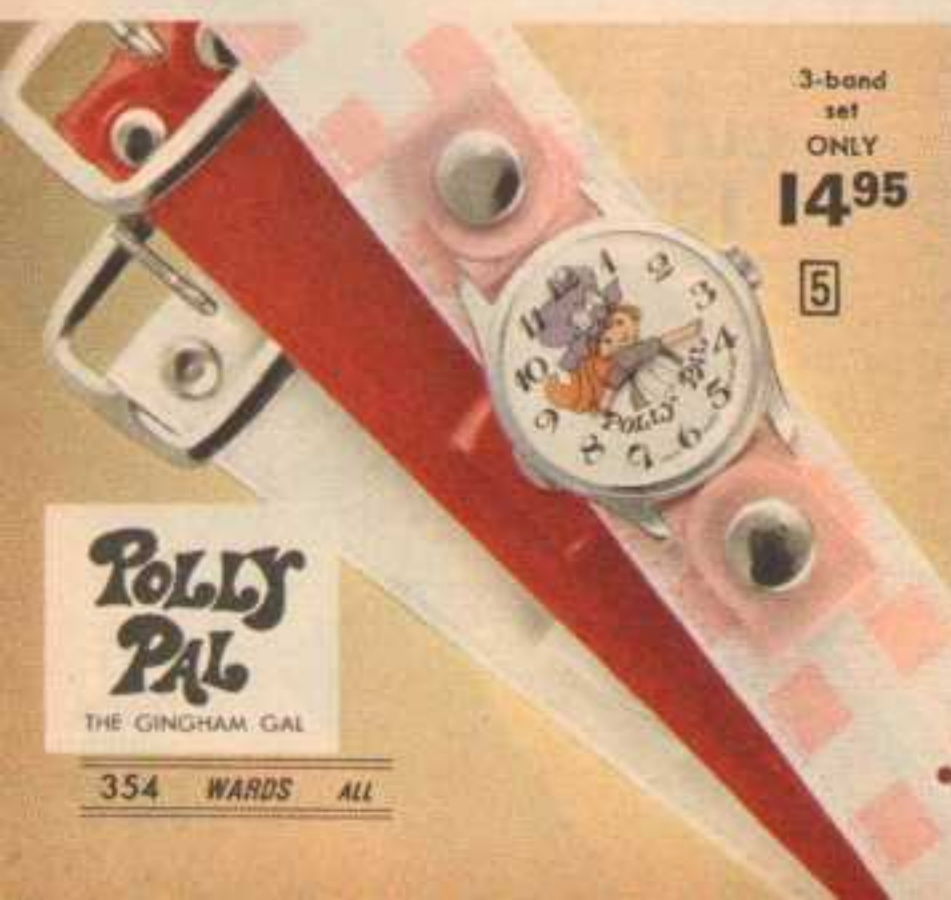
3-band set ONLY 14 95