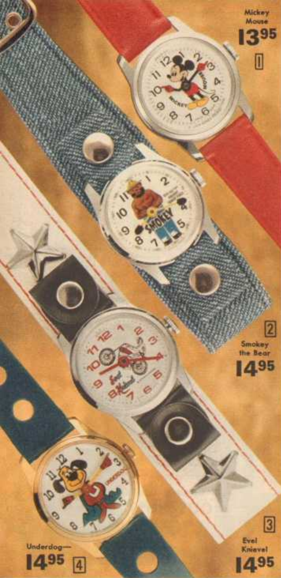
Mickey Mouse 13 95