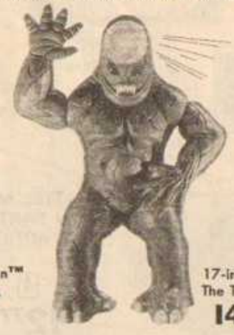
17-in. Zogg™ The Terrible™ 14 94

The first truly electronic toy! Equipped with 3 electronic nodes, he talks, responds to commands, seems almost alive. Prevents friend and foe alike from entering your domain unheeded with a warning whoop or beam of light. Needs 3 "C" batteries (order p. 335). 48 T 23090—Ages 5-up. Wt. 2 lbs. 19.94