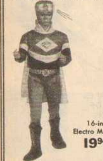
16-in. Electro Man™ 19 94

2 Evel Knievel Super Cycle. Rev up the bike in the energizer and watch it race at top speed... even performs "wheelies." 10 1/2 in. long with fire-red plastic jet pods. Energizer, Figure included. 48 T 23303—For Ages 5-11. Wt. 2 lbs. 8 oz. 14.94 3 Evel Knievel C.B. Van actually broadcasts 6 popular C.B. expressions in Evel's own voice. Red, white and blue 12x6 1/2 x9-in. high. California-style van comes with gull-wing door, rear-mount bike rack and other accessories. Jump rack hooks onto end so Evel can vault over van. Needs 1 "AA" battery (sold p. 335). 48 T 23385—For ages 5-11 years. Wt. 4 lbs. 5 oz. 13.94