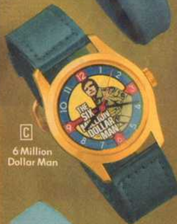
C 6 Million Dollar Man