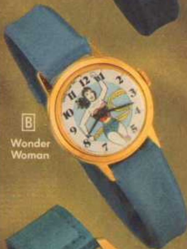
B Wonder Woman