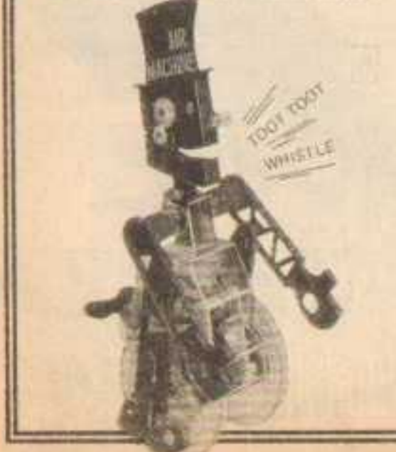
17-in. Whistling Mr. Machine® 13 99

Half-man, half-monster, Zogg drops his hairy arms and topples to the ground if hit by a beam of light. A perfect target for Electro Man™ (left), or for you with your trusty ray gun (incl.). Batteries not incl.—order pg. 335; 2 "C" cell for gun, 3 "D" cell for Zogg himself. 48 T 23091—Ship. wt. 2 lbs. 14.94