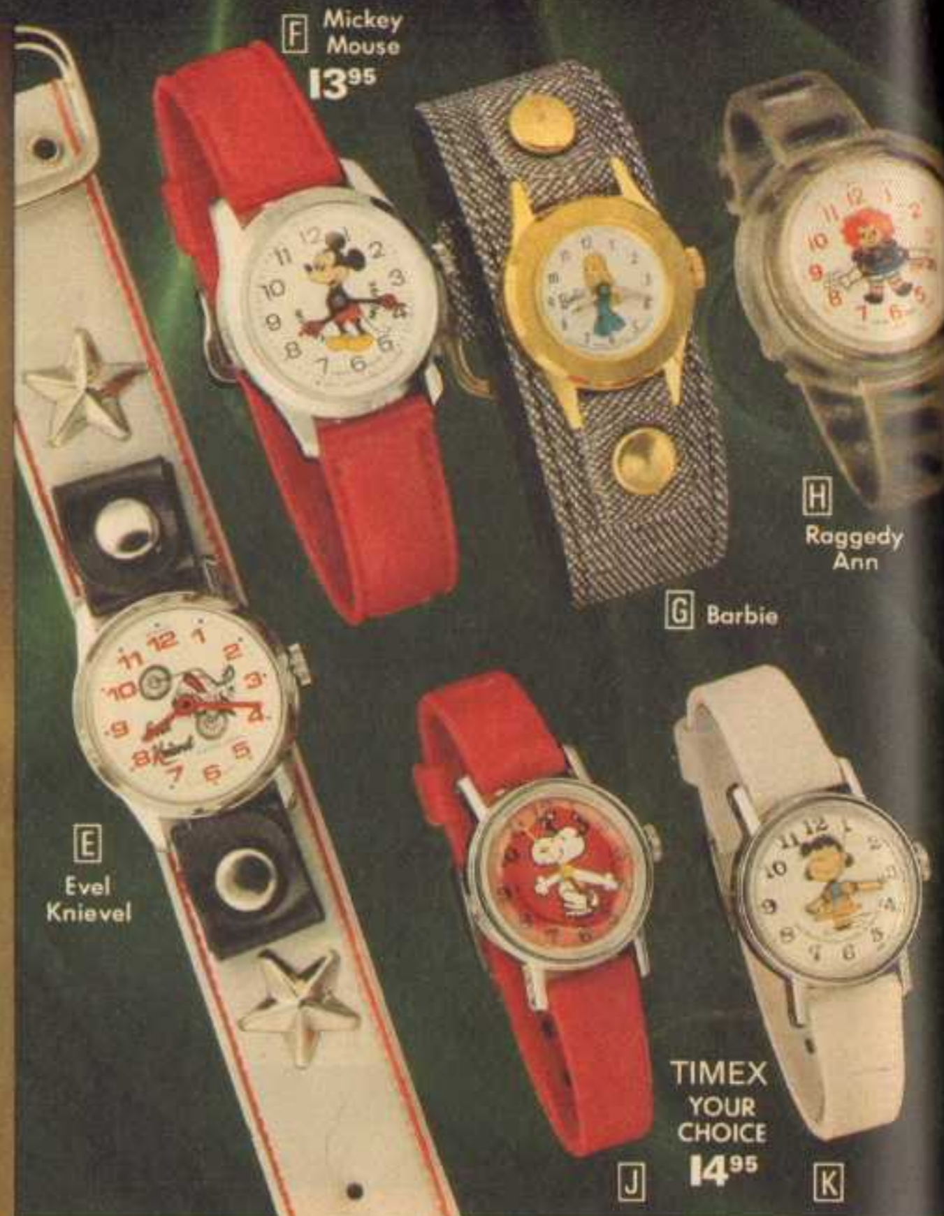
F Mickey Mouse 13 95